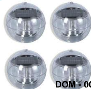
DOM - 009