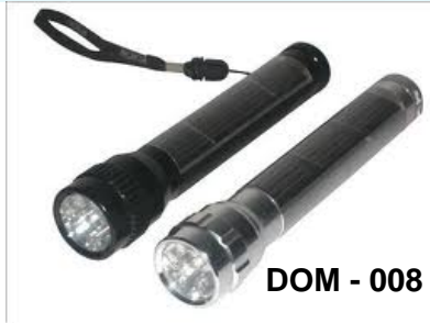
DOM - 008