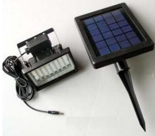
DOM - 019