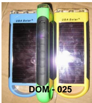
DOM - 025