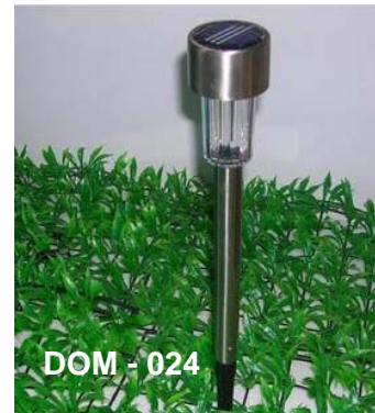
DOM - 024