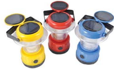
DOM - 018