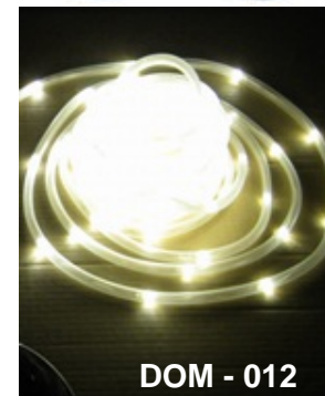
DOM - 012