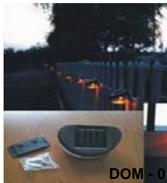
DOM - 011