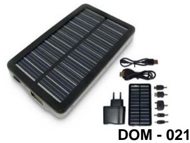
DOM - 021