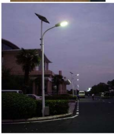
COM - 014