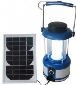
DOM - 017