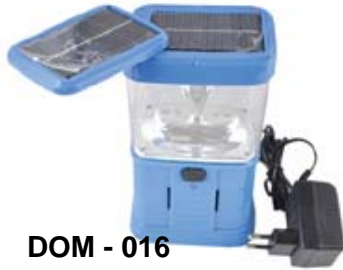
DOM - 016