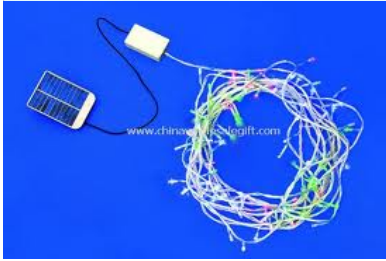
DOM - 007