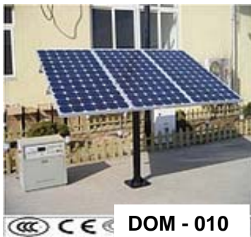
DOM - 010