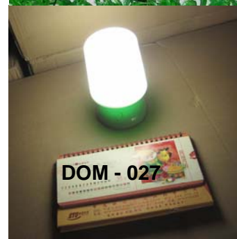
DOM - 027