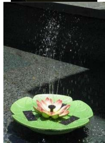
DOM - 015

Building No. 457, Area 1, 699 Jinqiu Road , Shanghai-200444, China Tel: +86( 021)56044691 : Fax: +86 021-56134798 Email: info@sidlink.cn / info@sidlinkgroup.com www.sidlink.cn : www.sidlinkgroup.com