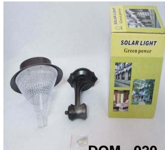
DOM - 020